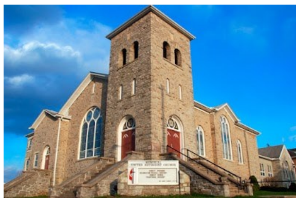
Quarryville UMC houses a 3-manual Walker digital organ.